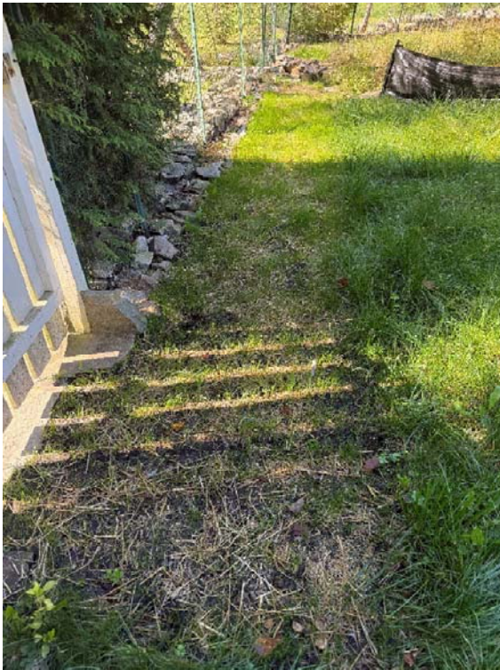
Grass Establishing in former concrete walkway South of Northwestern Leaf Removal Area Facing North, Photo Taken Oct 6, 2025