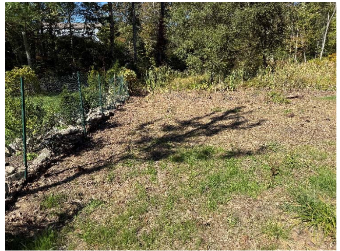
Grass Starting To Establish in Northwestern Leaf Removal Area, Facing North, Photo Taken Oct 6, 2025