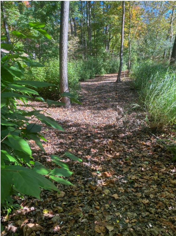
Nature path on property nearby