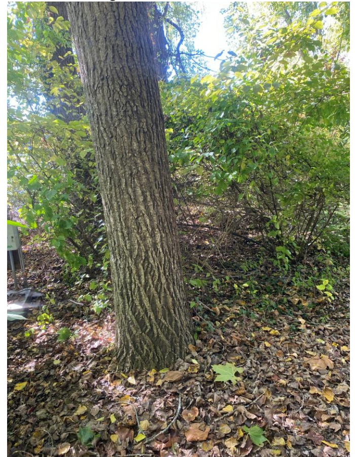
Cottonwood trees to remain