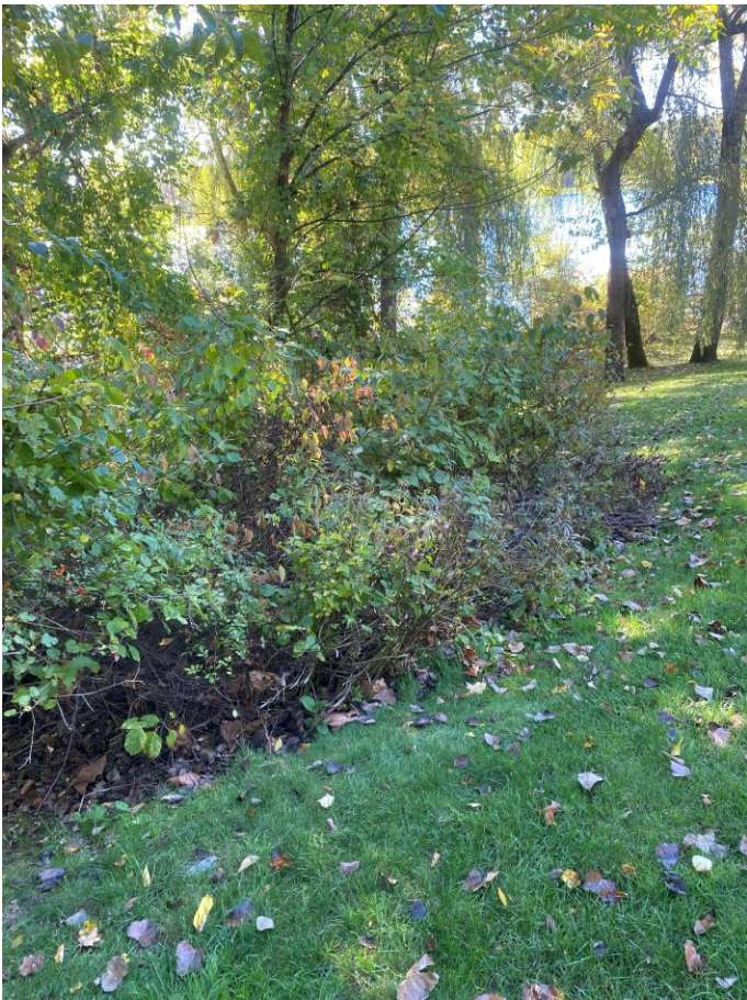
Area along hillside looking SW