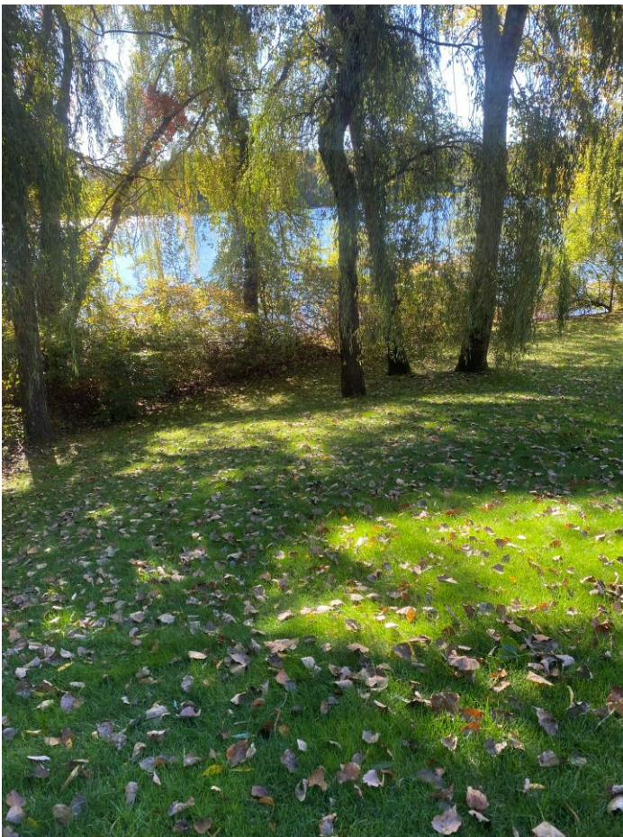
Area along shoreline looking SW

Photos below taken Oct. 9, 2025 approximately 10:30a